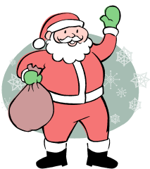
le Père Noël