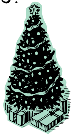
un arbre de Noël un sapin (pine tree)