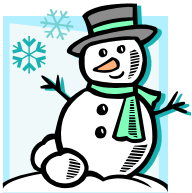
un bonhomme de neige

Merry Christmas ! Happy Festival of Lights ! Happy Chanukah ! I wish you a Good Year and Good health ! Best wishes for 2018!